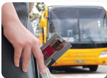
Automatic Fare Collection