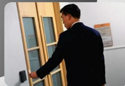
Physical Access Control