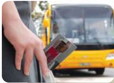
Automatic Fare Collection