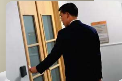
Physical Access Control